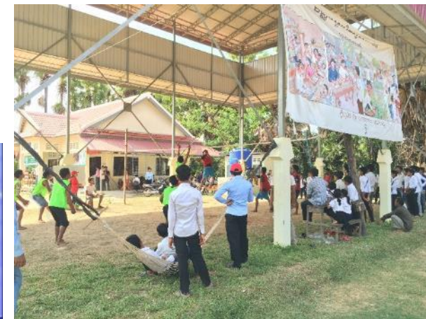
★2015/8 Night Operation & Karaoke Literacy?